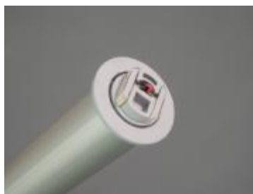
Motor in roller