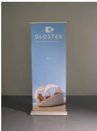
Step 10: Switch on the electricity. The installation is now complete

The information in this brochure is subject to change without notice. Any questions, please contact Drytac at info@drytac.com , 5383 Glen Alden Drive, Richmond, Virginia 23231, USA. Toll Free Phone 800-280-6013 Phone 804-222-3094 Toll Free Fax 800-622-8839