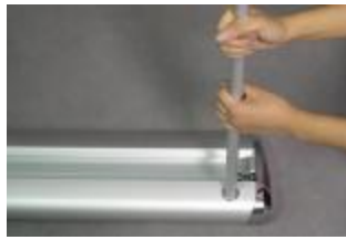
Step 2: Insert two poles. Make sure they fit in pole base completely.