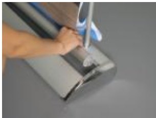
Step 7: Take out the bottom graphic roller from the base.