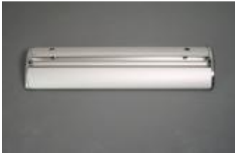
Step 1: Set the base on the ground.