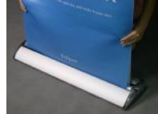
Step 9: Attach the bottom graphic roller to the base and make sure the motor end is located in the right metal slot