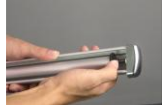
Step 3: Remove the narrow top graphic roller from the top bar.