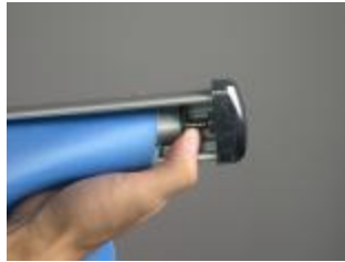
Step 5: Insert the top graphic roller into the top graphic bar. Make sure the roller fits snugly.