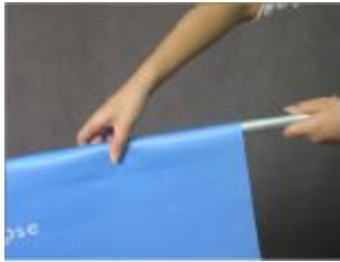
Step 4: Slide the graphic onto the top graphic roller.