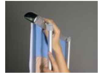
Step 6: Insert the top bar onto the poles.