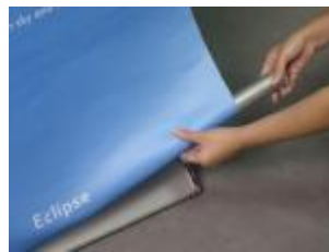
Step 8: Slide the graphic onto the bottom graphic roller.