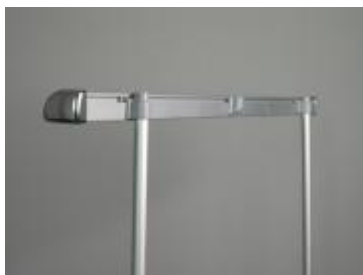
Top Graphic Bar