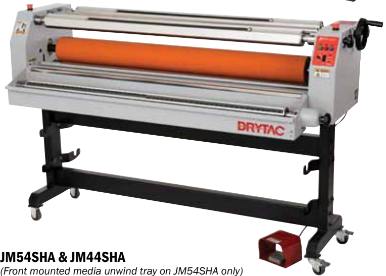
JM54SHA & JM44SHA

(Front mounted media unwind tray on JM54SHA only)