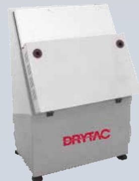
DES-3 Edge Foiler