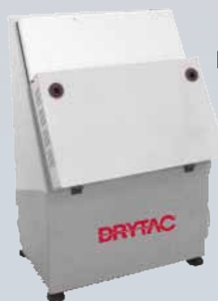
DES-3 Edge Foiler