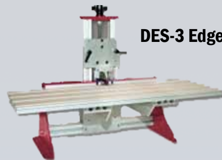
DES-3 Edge Shaper

The Edge Foiler applies a fresh finishing touch to your artwork by applying a standard foil tape on straight or beveled edges. Edge foils used with the DES-3 foiling system are available from Drytac in white, black, gold, and silver.