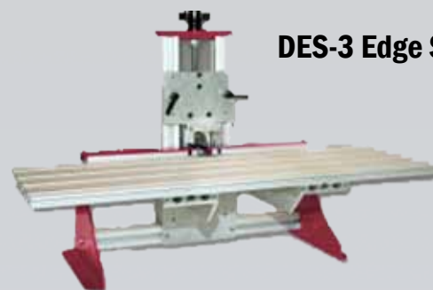
DES-3 Edge Shaper